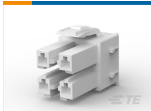
TE Part # 2-179861-1 AMP POWER D/LOCK PLUG HSG 4P