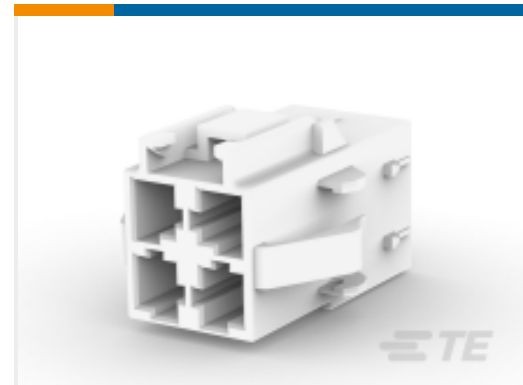
TE Part # 1903486-1 AMP PDL 6.5MM PITCH CAP HSG 4P